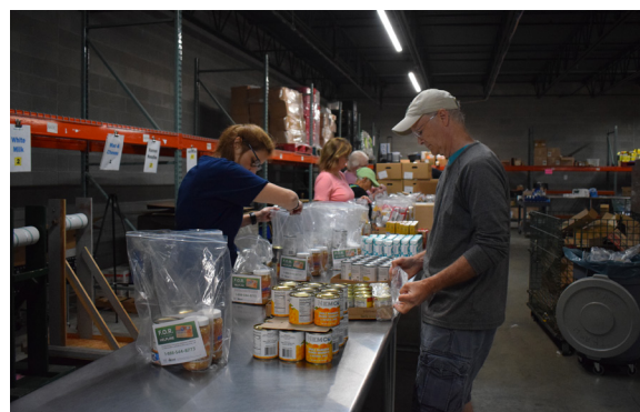
Volunteers pack Weekend Kits for kids at the GLFB distribution center in Bath.

With inflation impacting nearly every aspect of the cost of living and the very last of pandemic-related benefits expired, low-income families are spending more than 30 percent of their monthly budgets on food.