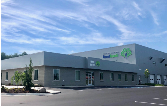
The GLFB distribution center is located at 5600 Food Court in Bath.

Together with our neighbors experiencing food insecurity, community partners and people like you, GLFB is making strides toward food security in mid-Michigan.