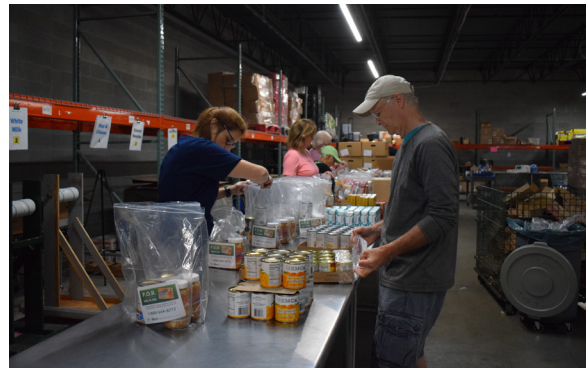
Volunteers pack Weekend Kits for kids at the GLFB distribution center in Bath.

With inflation impacting nearly every aspect of the cost of living and the very last of pandemic-related benefits expired, low-income families are spending more than 30 percent of their monthly budgets on food.