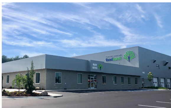
The GLFB distribution center is located at 5600 Food Court in Bath.

Together with our neighbors experiencing food insecurity, community partners and people like you, GLFB is making strides toward food security in mid-Michigan.