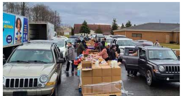
In 2022, GLFB distributed more than 9.2 million meals to mid-Michigan neighbors.

In addition to our main location in Bath, MI. GLFB exists in the form of a network of over 140 community partners, 95 community gardens and our growing network of volunteers, who work together to provide more than 25,000 hours of service on average annually.