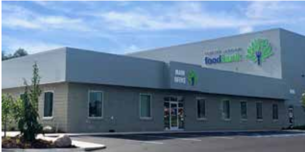
GLFB Distribution Center, Bath, MI