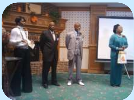
Members of the leadership team at Mt. Zion All Nations Bible Church's Eden project address gardeners and volunteers at their harvest celebration.

Unfortunately, we have seen too many gardens struggle to reach their full potential because the work has rested on the shoulders of one or two individuals. We strongly encourage there to be a group involved from the beginning stages of forming a vision right through the process of gardening. The most successful gardens involve a group or community of people in the planning, building, seeding, and harvesting of the garden.