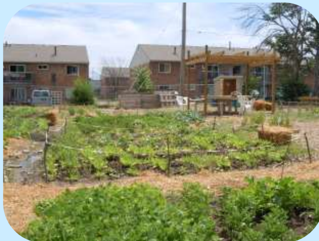
Orchard Court Community Garden sits on an ICLB parcel.

One important thing to consider is how the site is currently used. Putting a community garden at the edge of a baseball diamond that is still used is not ideal; however, putting a community garden in a park that has a surplus of open space and does not seem to be frequented for play or paths may work well.