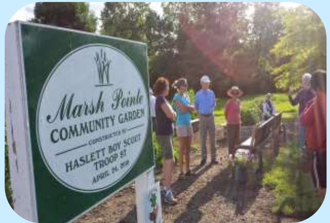
Marsh Pointe Community Garden.