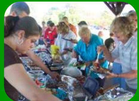
An annual Harvest Dinner hosted by Garden Project.

Please keep in touch with us about your challenges, needs, and successes throughout the year. We hope you will participate in any way you can!