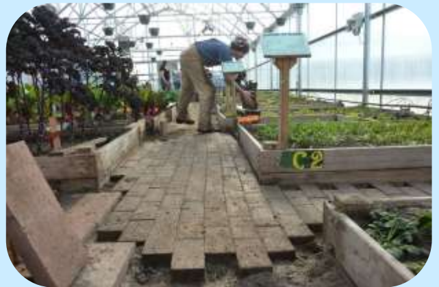
Improvements to the Hunter Park GardenHouse, making it more accessible.