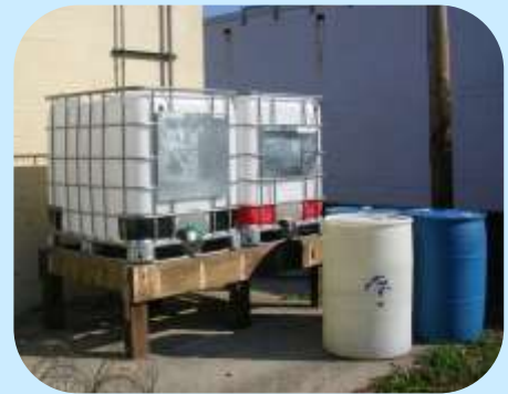
Northwind Community Garden rain water catchment.