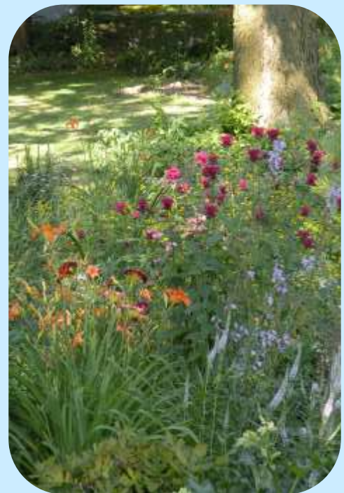
Perennials at the GP Demonstration Garden.

Growers often bring herbs, flowers, and vegetables starts in the spring to local farmer's markets. These will be favorite, tried & tested varieties that they can share growing tips on. Always great to ask a farmer!