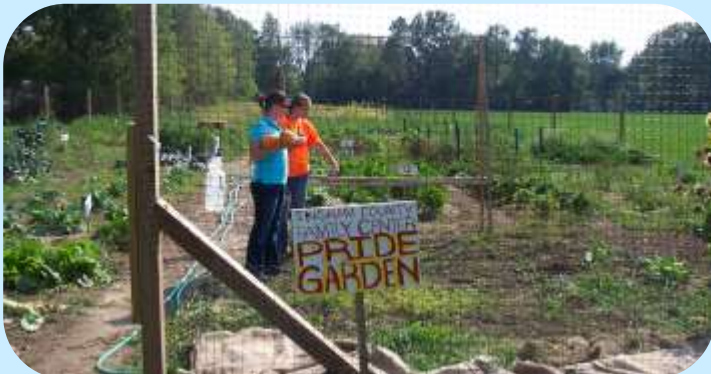
Tenax used at the Ingham Co. Family Center Pride Garden.

* Remember, a central rule of fencing: they are a barrier, not a deterrent.