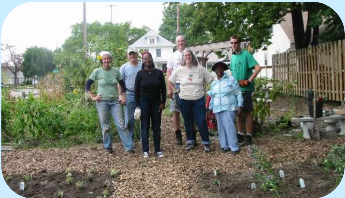
ELF garden was formed with the help of The Garden Project negotiating a land agreement.

The Garden Project maintains a liability policy for a number of the gardens we work with. If the goals of a new garden fit within our scope of work, we may be able to add additional gardens to our policy.