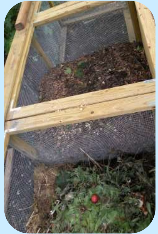
Prospect Place Pocket of Peace Community Garden's compost bins.

https://www.hammondfarms.com/store-locations/