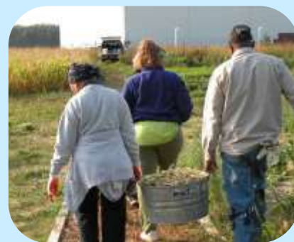
Garden leaders working together to harvest the garden.