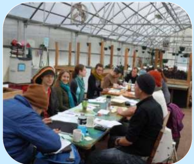
Including Our Neighbors grant advisory committee meeting.

The Garden Project is a member of the American Community Gardening Association and regularly gets updates on different charitable giving programs and corporate sponsorships. We will send those that look promising to our Facebook page and to Garden Leaders in case they are interested in applying.