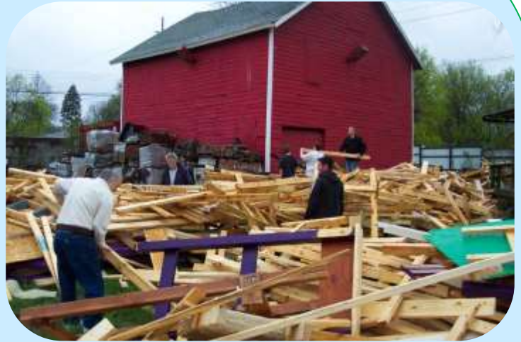
Loads of loft lumber.

Hours: Noon to 3:30 p.m. Monday, Wednesday, and Thursday