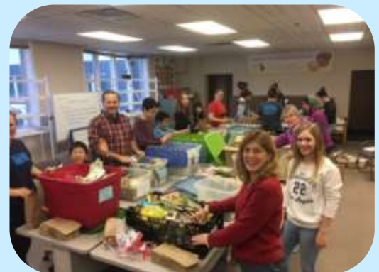
Volunteers assembling Garden-To-Go bag on MLK Day.

A national website where you can register an event or organization and volunteers will sign up. www.volunteermatch.org