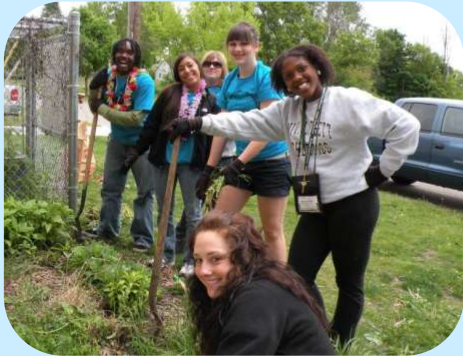
Youth leadership volunteers at the Resource Center.

A successful community garden relies on people who feel motivated to participate. A good way to encourage this motivation is to carefully cultivate relationships with fellow gardeners &/or neighbors. Try to find consistent, easy-to-handle tasks for a variety of people, instead of a lot of different tasks for just a few people. For help with cultivating connections, call The Garden Project!