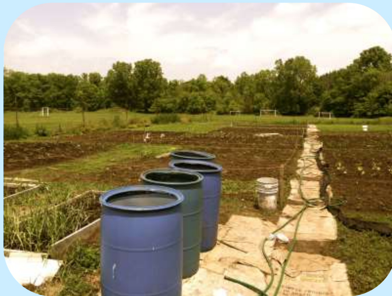
Okemos International Garden uses 55 gallon drums to store water & burlap bags to smother weeds

https://communitygarden.org/programs/advocacy/