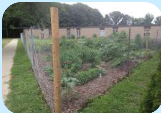
Woven wire used at the Averill Woods Elementary.