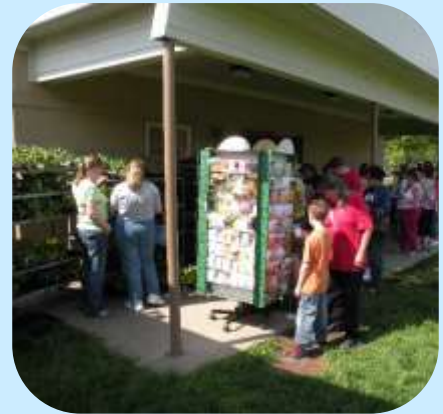
Gardeners select seeds and transplants at the Garden Project Resource Center in Foster Park.

The Resource Center is in Foster Park, at the corner of Marcus and Foster on Lansing's east side. Foster Park is on Kalamazoo St. at Foster St. (between US-127 and Clemens [Aurelius] and between Kalamazoo and Marcus streets). The Resource Center is a beige pair of buildings at the south end of the park.