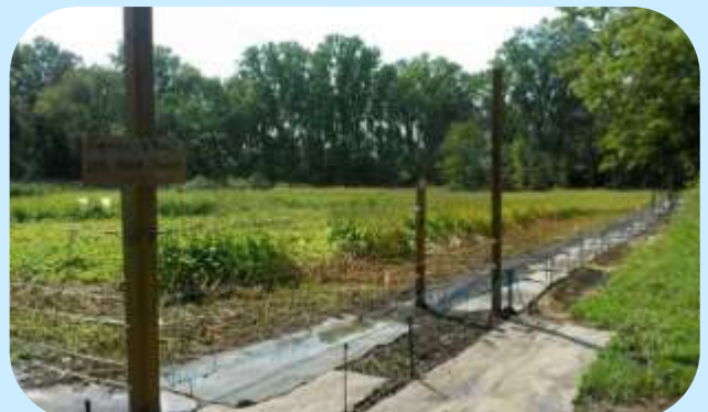
Electric used at the Lilac Garden in East Lansing.