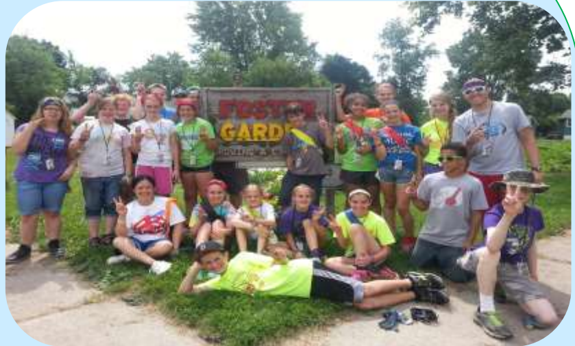
Impact volunteers at Foster Garden.

The Garden Project is listed with the MSU Center for Service Learning, as well as VolunteerMatch, an online database. If you have a specific request for volunteers, we can check these sources for you and can help recruit a volunteer group for your community garden. Also consider neighborhood high schools and honor societies, Scouts, FFA (Future Farmers of America), 4H groups, the Boys & Girls Club and more. Your neighborhood community center (Letts, Foster, Southside, YMCAs, etc.) is another good source for group volunteer help.